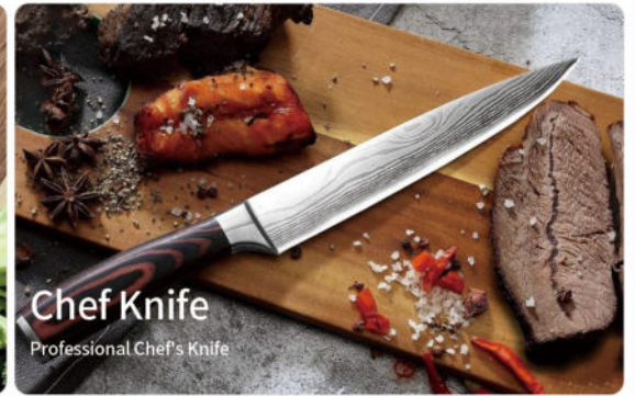
Chef Knife Professional Chef's Knife