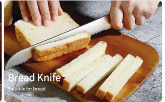
Bread Knife Suitable for bread