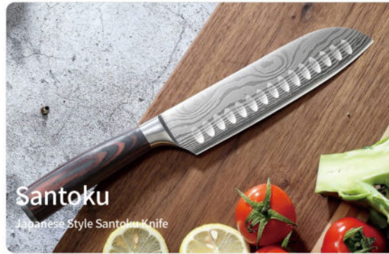
Santoku Japanese Style Santoku Knife