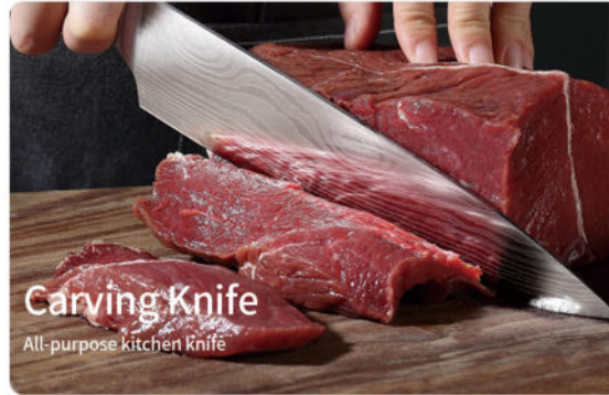
Carving Knife All-purpose kitchen knife